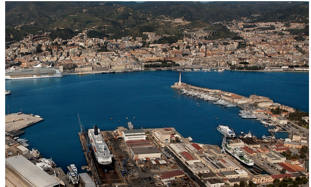
The port of Messina