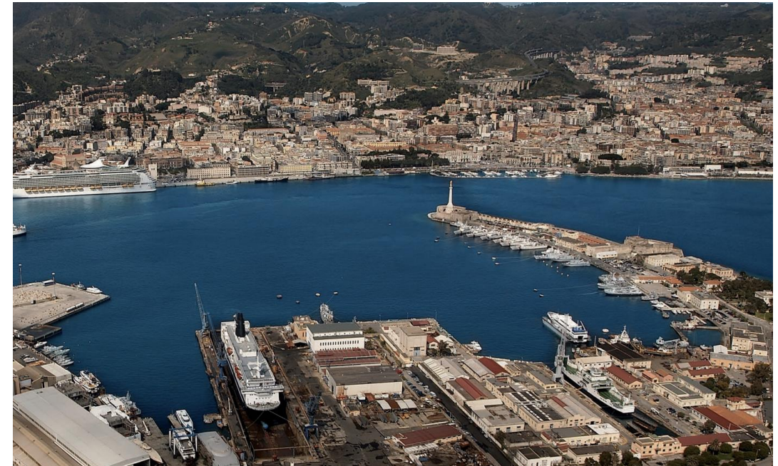
The port of Messina