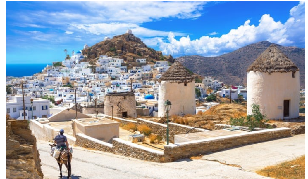
Chora, the island's main town