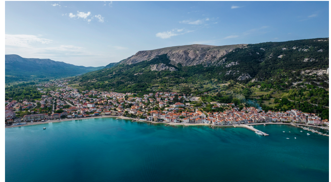
The town of Baška on Krk island