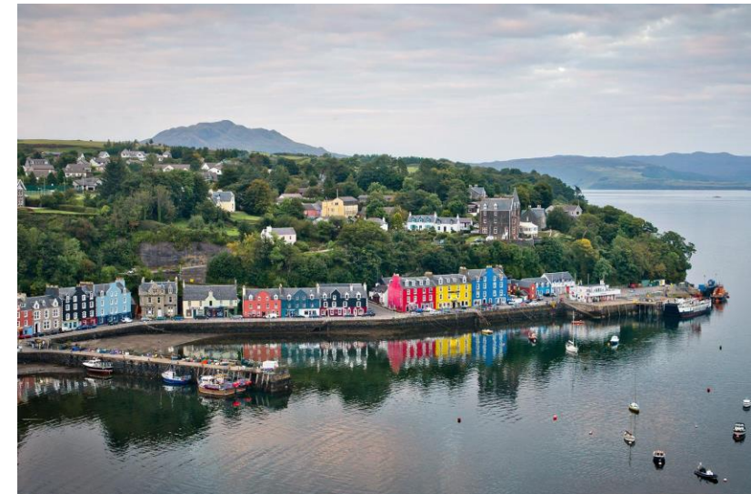
The Isle of Mull